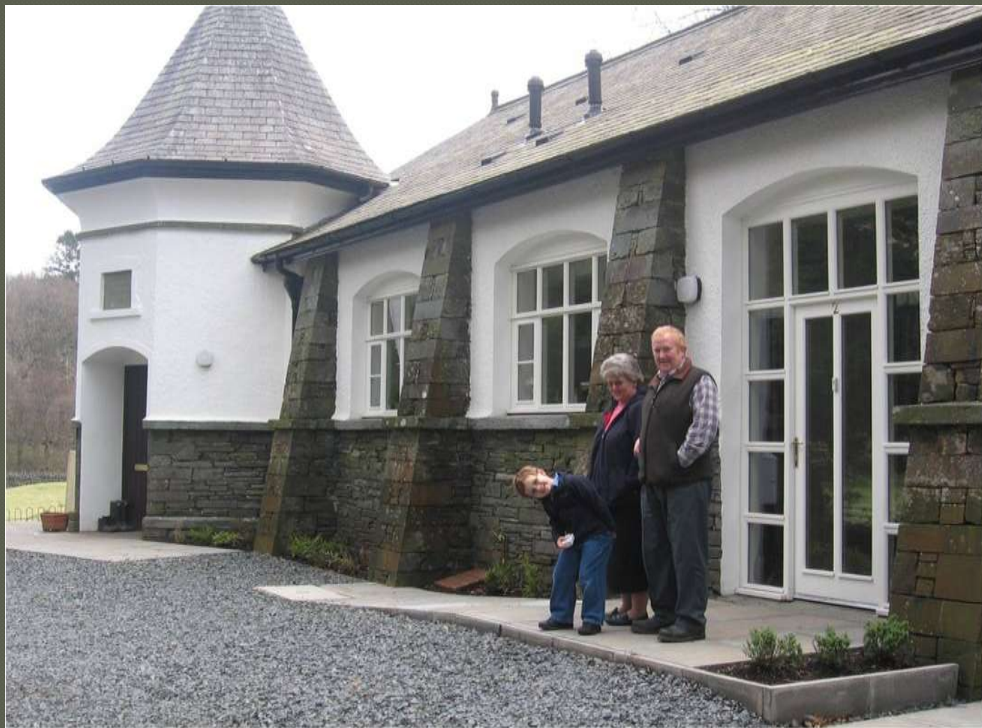
John Hext House, Coniston